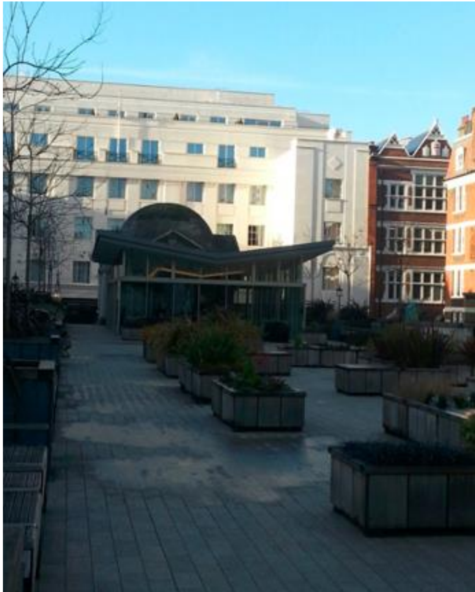
Brown Hart Gardens Deck